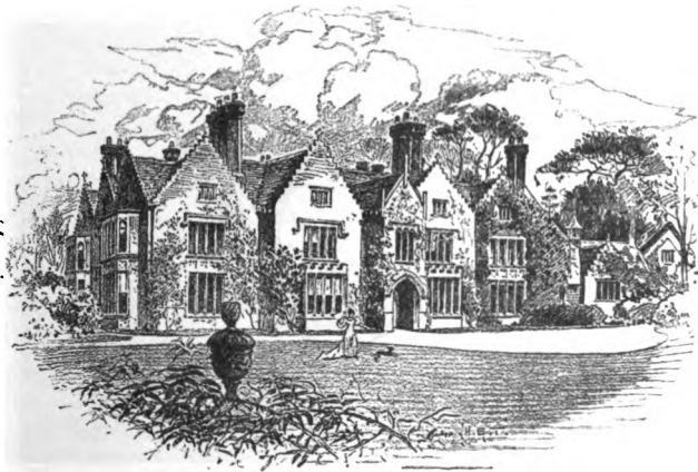
THE NASH, WORCESTERSHIRE.